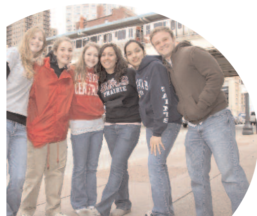
CivicWeek: Chicago students stop to pose for a picture.

Nonprofit Organization U.S. Postage PAID Permit No. 205 Evanston, IL 60208