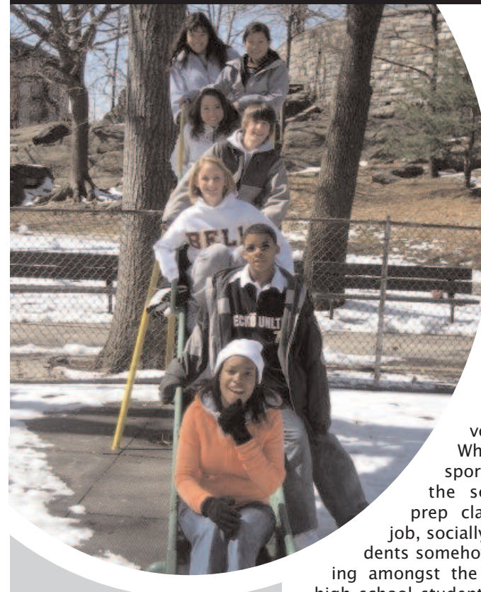
CivicWeek: New York students take a break on a local elementary school playground.

Continuing to volunteer during college enriches students' experiences, makes a significant impact on communities, and promotes a positive image of young people